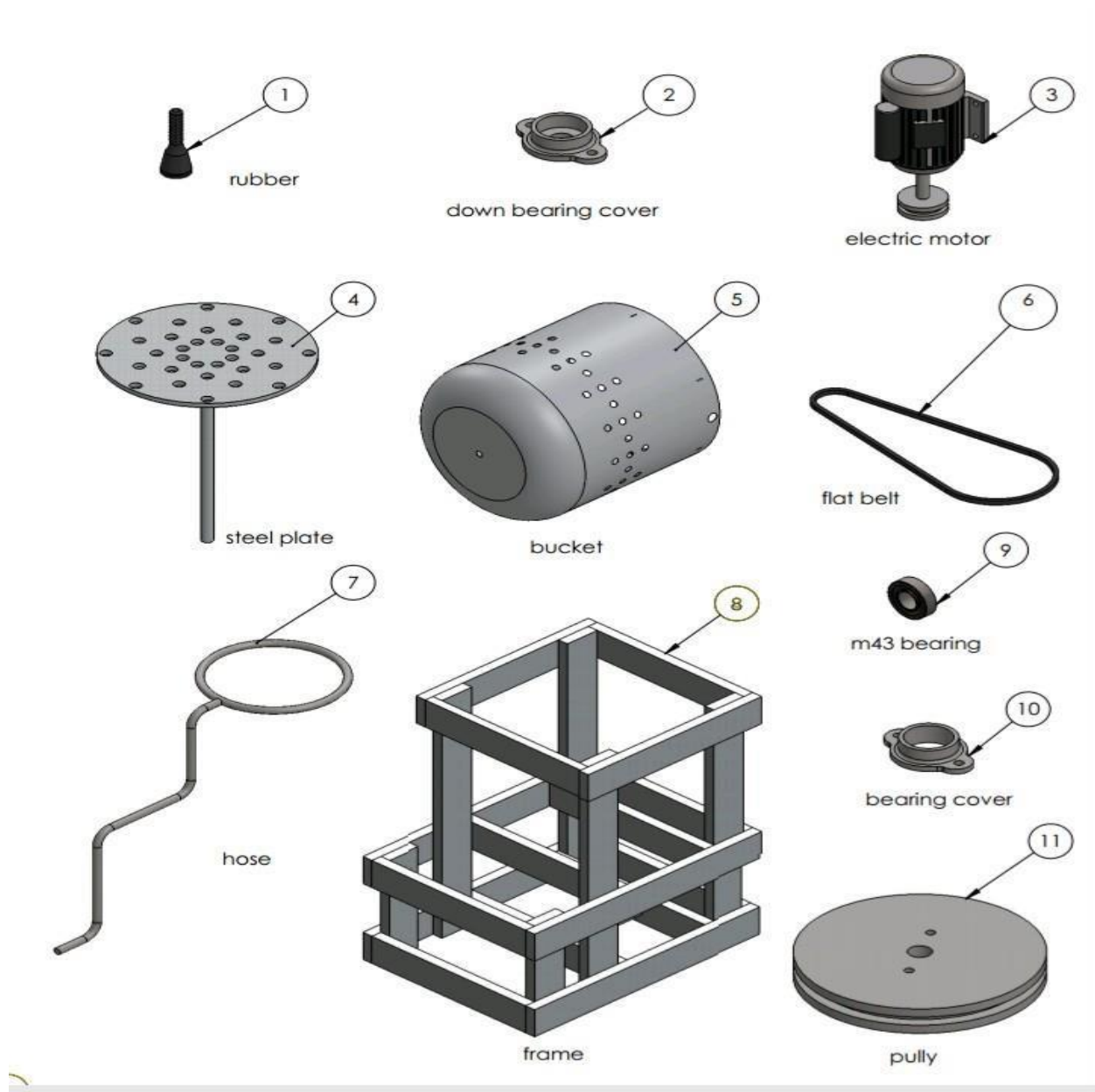
Figure 2.0: Different component used in fabrication of feather plucking machine.